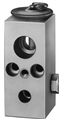
H-Block Expansion Valve

Protect your investment by examining the Expansion Valve